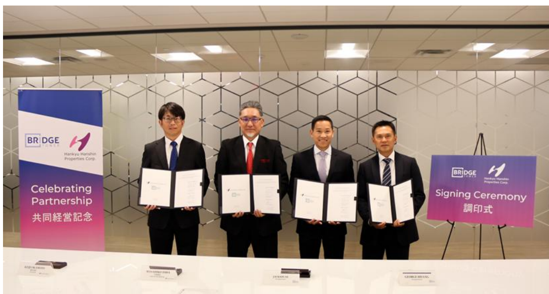
Joint Venture Agreement Signing Ceremony on January 23, 2026

This project involves the development and sale of a total of 97 detached housings in Dallas–Fort Worth, a prominent U.S. business area